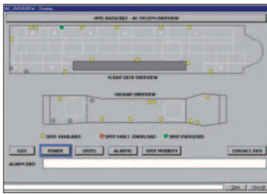
SCADA Screen Example